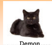
Demon or Rose?